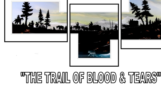
CHEROKEE NATION PURCHA