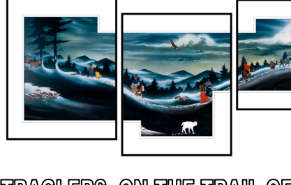
"STRAGLERS, ON THE TRAIL OF TEARS"